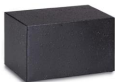
Painted Steel Chest